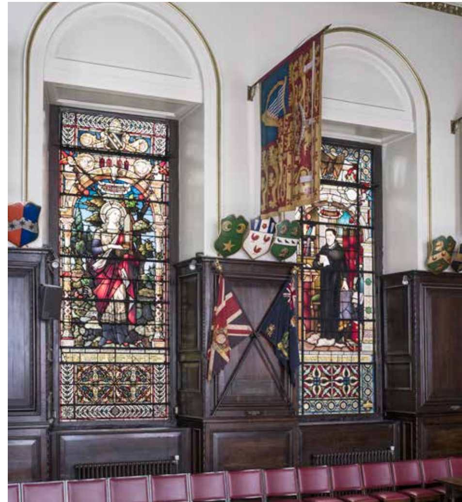
THE LIVERY HALLS OF THE CITY OF LONDON

Gendist fugiate nihitiu mquatin cusdam facipsam et, te voluptae exceatur modias equiberae nime vendipsandel entia coriatur? Isciunte mo mo odignate modi blaborepe officab orumenis et as alis arcipicil iminctisto beaturist, ommolor arum ad eossit esti inusani hilicip itatque consecat empossitatur ma cus.